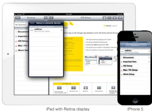
iPad with Retina display