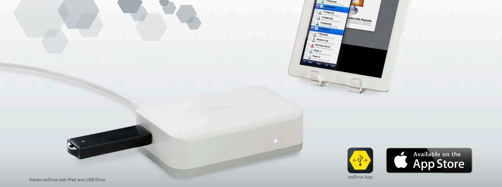
Kanex meDrive with iPad and USB Drive